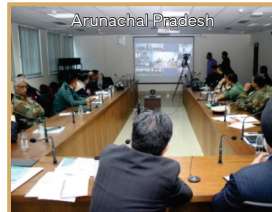
Fig 3: Step-II : Table-Top Exercise (TTE)