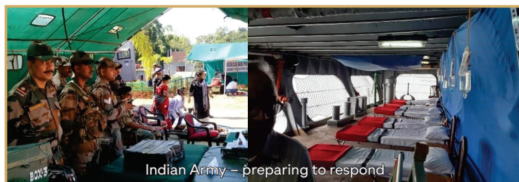
Fig 5: Joint HADR exercises

Joint humanitarian assistance & disaster relief (HADR) exercises: The Hon'ble Prime Minister Shri Narendra Modi had, during the December 2015 Combined Commander's Conference (CCC), directed that HADR exercises be conducted by the Armed Forces, involving all stakeholders, including Central Armed Police Forces (CAPFs) and the civil administration, down to municipal level. These HADR Exercises are being jointly planned as an annual calendar and coordinated by the HQ Integrated Defence Staff (IDS) and NDMA. The aim of these exercises is to foster joint planning and preparation towards effective inter-agency collaboration during disaster rescue and relief operations. Consequently, a number of joint HADR exercises have been held. The details are as below: