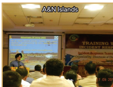
Fig 1: Step-I of the Mock Exercise process – training of officials

The table below shows at a glance the four-step process in a mock exercise, which is conducted by an NDMA Coordinator in conjunction with State/UT authorities: