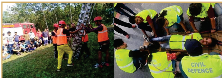
Fig 6: Training of civil defence volunteers