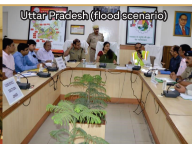
Fig 2: Step-I of the Mock Exercise process - Orientation & Coordination Conference